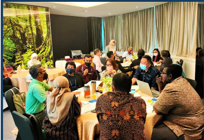
Eco Host Modules